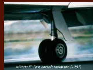
Mirage III. First aircraft radial tire (1981)

virtually every type of ground transportation and, of course, we were the first to develop radials for aircraft. Our tires were on Lindbergh's famous flight across the Atlantic, and they've been on every NASA Space Shuttle since the first launch. But since we're never satisfied with the status quo, we're just getting started.